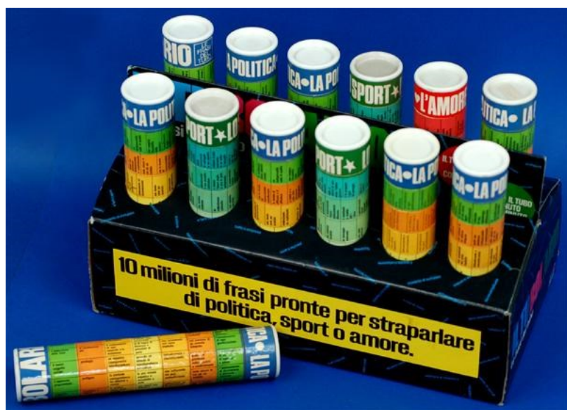
Figure 7. Tubolario (1983).

Out of production for years and almost completely forgotten, “Tubolario” has been recently rediscovered thanks to an interactive online remake. 23 In some forums 24 dedicated to “Tubolario” several users remember that “era semplicemente un gioco per ridere un pò e prendere in giro [...] certi discorsi roboanti che però nessuno capiva.” 25 The same ludic approach, as already said, features Italian automatic generators present on the web, in most cases designed with political and social satirical intent, a percentage that is well expressed by the collection realized from 2008 to 2012 on the metilparaben blog. 26 Among the 101 generators collected, 85 are related to political satire, 11 to social satire, 3 to religious satire, and one of them parodies the jargon of marketing. In particular, it is possible to note that the generators of political and social satire 27 seem to be characterized by contingency: namely they are concentrated on specific issues related to news or social events and designed in conjunction with such events. Another interesting example could be represented by the website aVanvera , 28 updated to November 2004, as it presents some of the main features of Italian