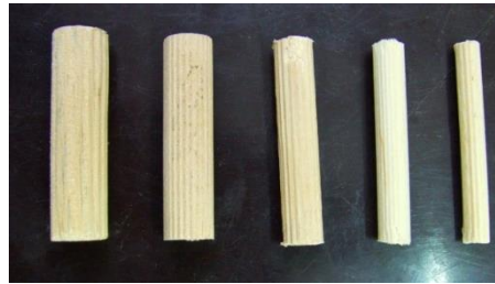
Figure 2 - Firebrand samples

Birch tree cylindrical samples with diameters of 6 mm, 8 mm, 10 mm, 12 mm, 14 mm and 50 mm in length were used as firebrands (fig.2).