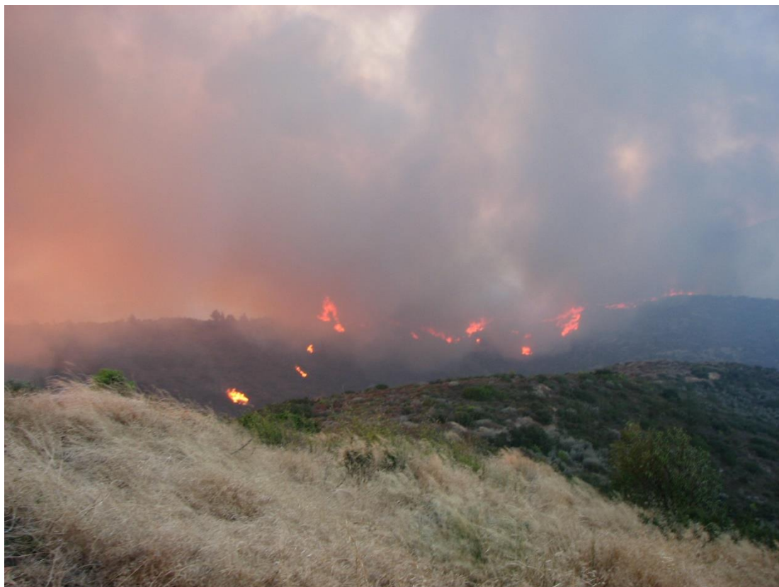
Figure 4b - An across-wind pattern of landing embers, on phrygana beyond the flank of a surface wildfire that spreads through rough landscape

The along-wind pattern of groups of spot fires has been observed to form a roughly elliptical shape (Figure 4a) and seems to be more predictable, while the across-wind one (Figure 4b) is irregular. Although these patterns have not yet been thoroughly described, they may allow firefighters to get a feeling on what to expect, a practically useful information: those patterns may play a crucial role in