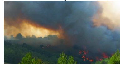
c. Five more spot fires have occurred at 180, 200, 230 and 240 m and some of them have already merged, two minutes and six seconds later (at 15:26:10).