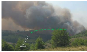
a. The first spot fire is recorded at 15:23:56 at a distance of 200 m