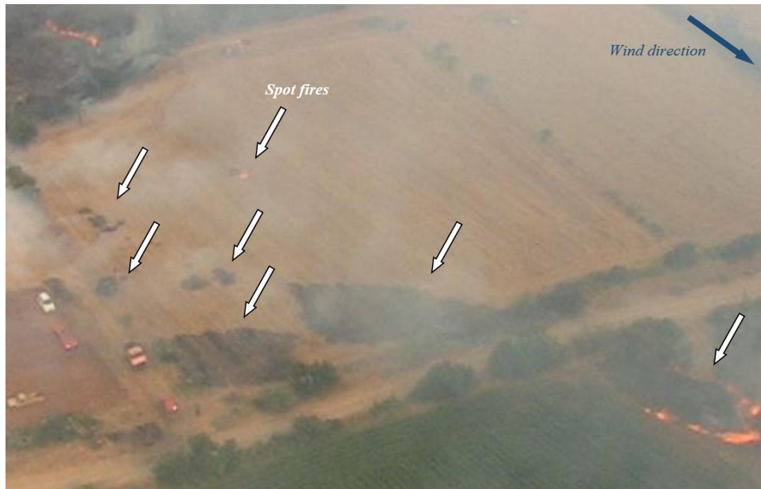
Figure 4a - An along-wind pattern of landing embers, on grass, downwind from a surface head fire