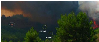
b. Two more spot fires at 15:24:04 at 80 and 110 m (while the first one at the left is growing)