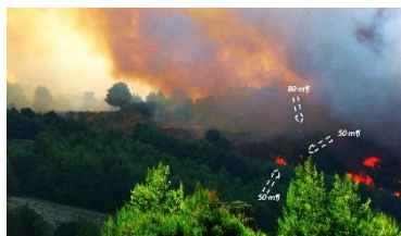
d. Three more spot fires at 15:26:54 at 50 and 80 m (in total, eleven spot fires recorded, within a period of 2 minutes and 58 seconds)