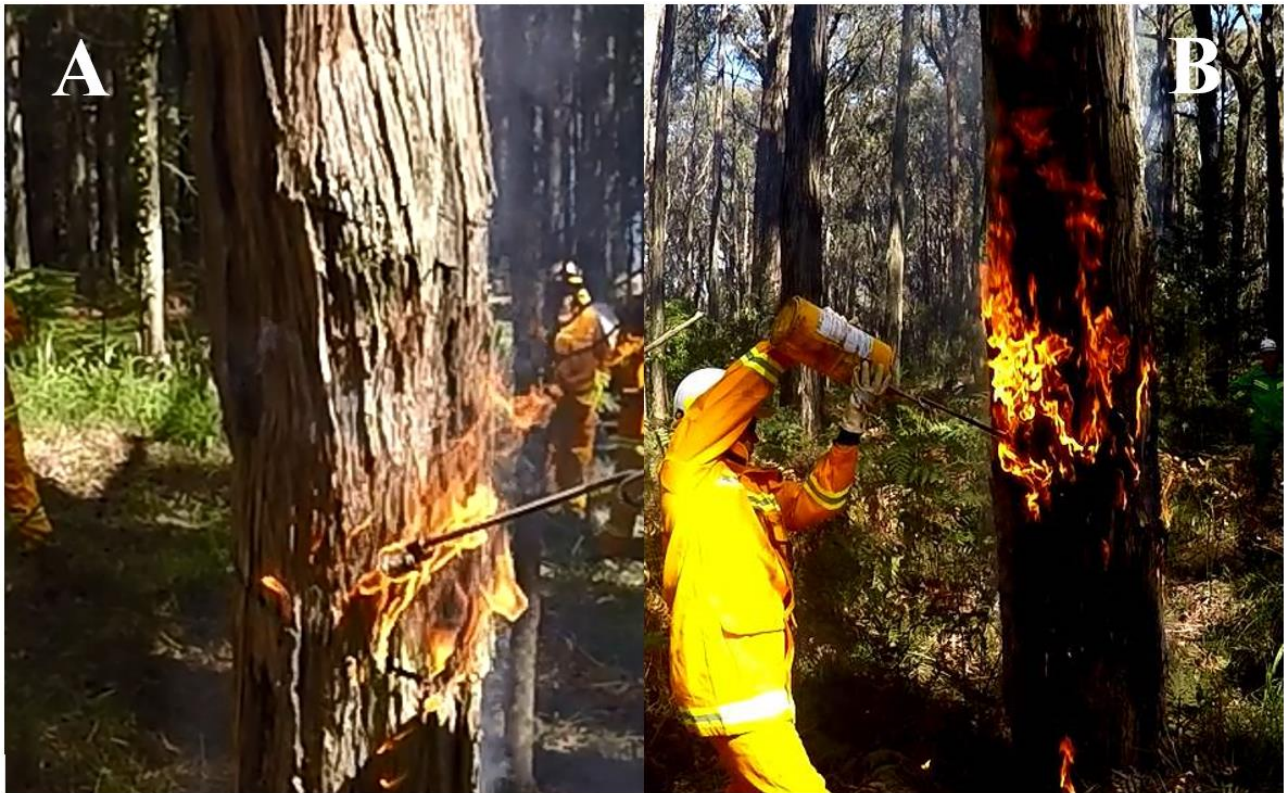
Figure 2 - A) Fibrous bark of Eucalyptus Obliqua . B) Candling of E. obliqua during winter in South Eastern Australia