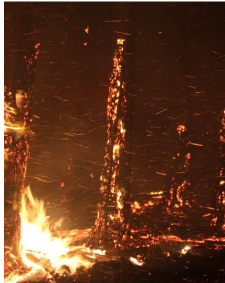
Figure 1 - Firebrands from Eucalyptus obliqua trees during an autumn prescribed burn adjacent to a control line

The bark of one genus of trees is recognised for its contribution to spotting in damaging wildfires worldwide, Eucalyptus . Eucalypts typically either have smooth bark that is shed annually or fibrous ‘stringy’ bark that is retained (Blanchi and Leonard 2005). The fibrous trunks of species such as E. obliqua are easily ignited, and the loosely held nature of its bark means that they produce copious amounts of small firebrands (Fig 1).