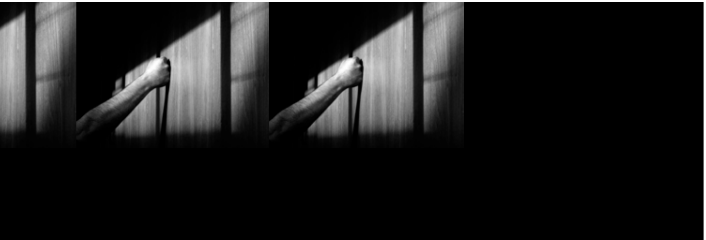
© Pedro Medeiros, #6 - Coimbra, FEUC [Autorretrato]

The public service sector is also active in the provision of content and services that are intended to support democracy, both as a system and as a process, and the values that are required for both