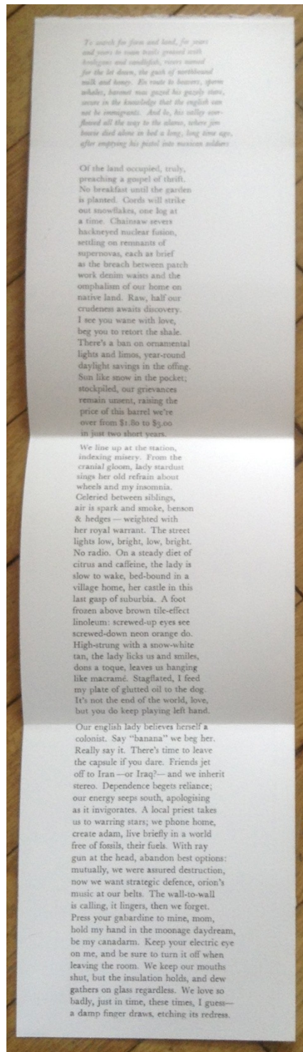
Figure 3. Sara Crangle, gimme your hands , Crater Press.