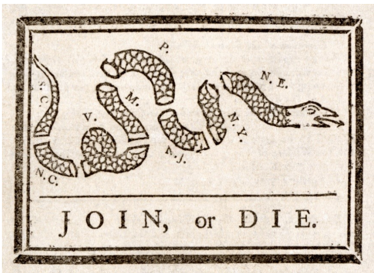
Figure 1. 'Join, or Die'.

While Franklin's career insists on a moving-away from Keimer's not-printing down more practical, profitable, Yankee avenues, some of his most famous printed interventions contain, nonetheless, the savour not-printing. Franklin's famous propaganda image, the 'Join, or Die' snake, is one such example (Figure 1). First published in the Pennsylvania Gazette on the 9 th of May 1754, here Franklin takes the American colonies (Delaware and Georgia are omitted and the four states of New England are shown as one, bringing the total down number of states from thirteen to eight) and divides them, after the image of the snake that, according to folklore, if reassembled before nightfall on the day of its death would back to life. Franklin's interrupted snake insists that we must urgently put these divided, disagreeing states (divided through the machinations of the British) back together before it's too late, to revivify as an identifiably 'American', post-colonial serpent. The image became an important identifier for the pre-revolutionary period, as the states began, for the first time, to feel a unity in contradistinction to their connection with Britain, and was then utilised throughout the War of Independence. We might see, then, a ghost of Keimer's obstructed printing in the divided snake of the Pennsylvania Gazette ; a dissociation that would colour the founding of the republic.