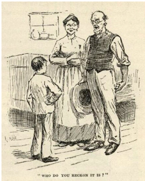
Figure 2. The Adventures of Huckleberry Finn.

Twain's career was not without the obstructions of not-printing, however. In 1884, as Twain was readying the first edition of The Adventures of Huckleberry Finn for the Christmas market, a disgruntled engraver, whose identity has not been discovered, made an obscene addition to the plate of E.W. Kemble's picture of Silas Phelps on page 283 (Powers, 2006: 481-504)(cf. Figure 2). Thirty thousand copies of the book had already been printed before the addition was spotted and a delay of some months, and the missing of the Christmas market, followed as a new plate was made-up, and replacement pages printed and bound into the original copies.