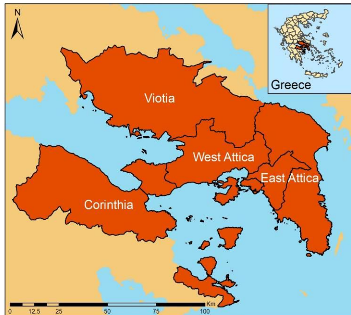
Figure 1. Map of the study area in Greece.

The study presented here is an investigation of the fire weather conditions leading to large forest fires in the broader area around Athens, the capital of Greece. It was prompted by the operational need to tie the potential for such fires to FWI, in conjunction with the finding of studies like the one by Dimitrakopoulos et al. (2011) that the Fire Weather Index (FWI) while highly correlated to fire occurrence is only moderately correlated to burned area.