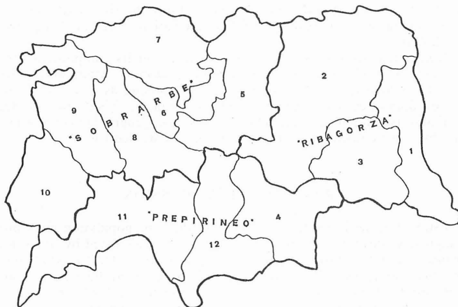
Fig. 2 — Studied «Comarcas».