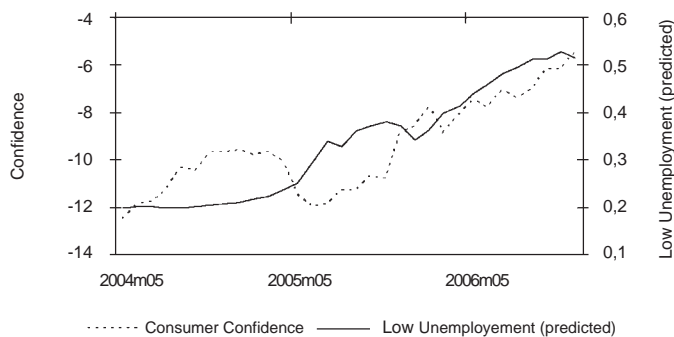
Figure 3 – An ex-post (2004 enlargement) prediction exercise

The results in this section thus specify the usefulness of this out-of-sample exercise as indeed, they clearly support that the ('low' category of) unemployment rate could be used to predict the evolution of the consumer confidence, in the case for the period after the 2004 enlargement.