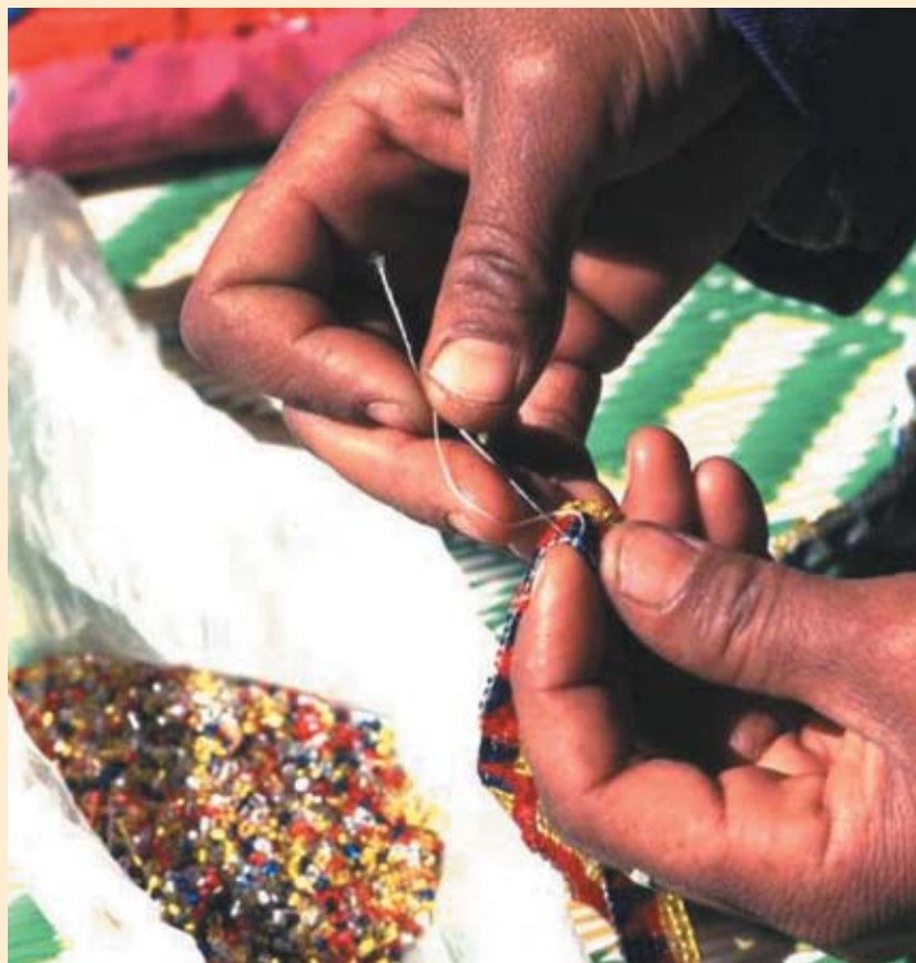
Changes are needed to learning approaches to help individuals to acquire competences.

Participants at a European Training Foundation workshop on Key Competences for Lifelong Learning (Turin, 30–31 March 2006) discussed what was understood by effective pedagogical (learning) strategies and methods, by a favourable learning environment and by 'education as a total experience'. Examples mentioned include