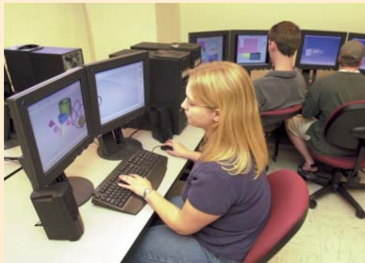
Reading and mathematical competences are no longer sufficient to help individuals meet demands in the workplace.

Key features of the underlying action competency model include the combination of knowledge and skills with psychosocial prerequisites, or the fact that 'reasoning and emotions are vitally connected', 6 as well as its context orientation.