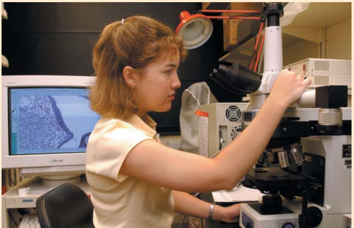
Key competences is a growing area in preparing learners for today's multiskilled economies.