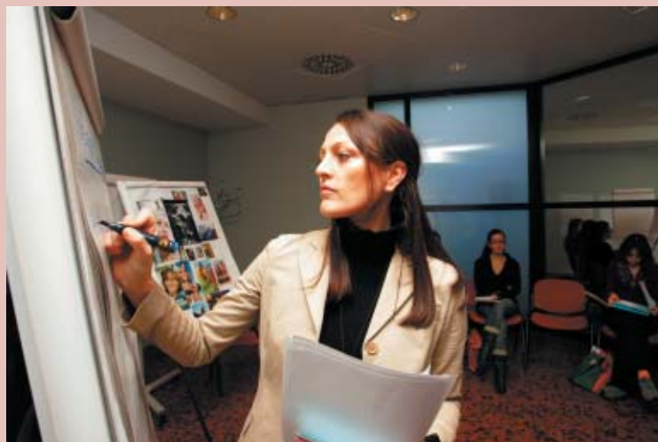
ETF staff ran the workshops which focused on economic and social issues affecting women in today's society.