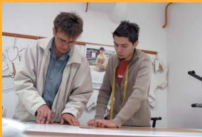
Entrepreneurship learning helps students to turn innovative ideas into working businesses.

This strategy has produced good results and its influence is now being felt throughout the university. The entrepreneurship learning modules developed by the faculty are now being offered to students of other faculties while staff from engineering are helping train other lecturers. In 2007, the entrepreneurship training materials will be made available online to all staff and students. The university is now planning to set up an incubator centre to support students wishing to turn innovative ideas into working businesses.