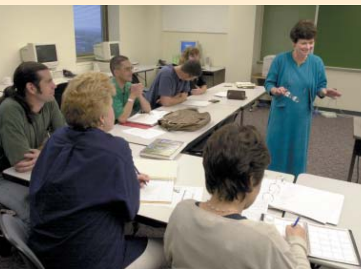
Entrepreneurship learning can deliver benefits to all participants.