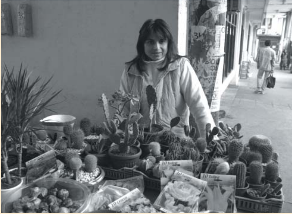
In Albania, ethnic minorities make up just 2% of the population.