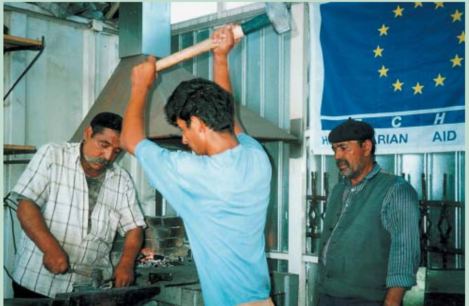
Cooperation and partnership between the EU and the partner countries will facilitate cross-regional learning.

Advisory Forum 2006 - http://www.af2006.etf.eu.int/