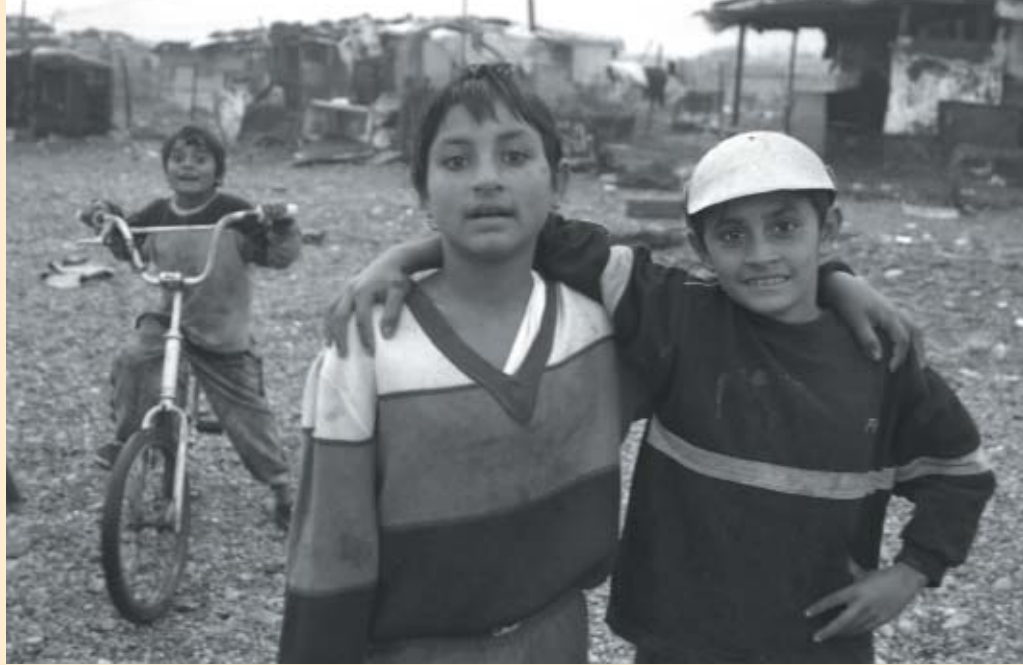
Roma children rarely receive education in their mother tongue.

The second model, encompassing the so-called submersion programmes, is generally used for weaker minorities. The effectiveness of this model, both in terms of educational outcomes and preservation of ethnic and cultural identity, is contested in international literature.