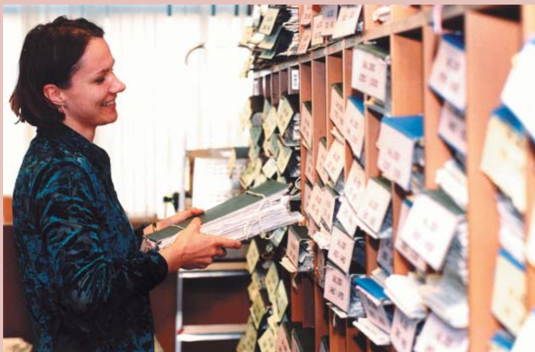
Working women in transition countries get much more of a raw deal than men.

Discrimination against women with children often takes place in an unofficial way, making it more difficult to challenge.