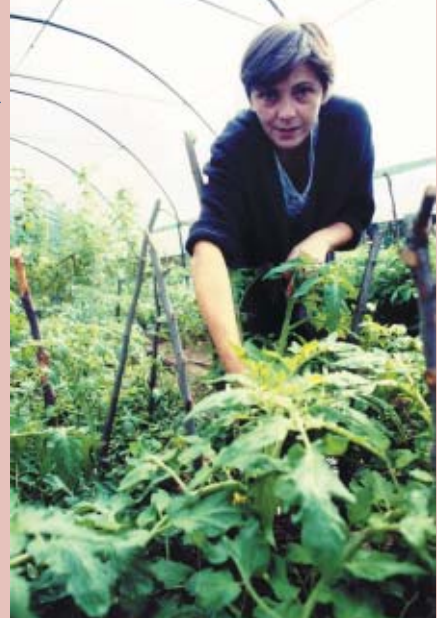
Women entrepreneurs need more support to start up small businesses.