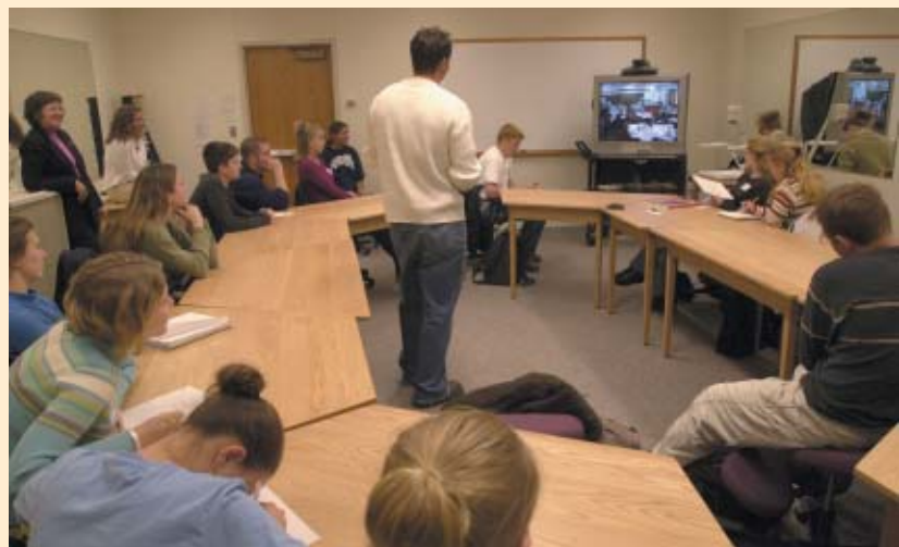
Key competences call into question what exactly should be taught in schools and how.

The teacher should act as an observer, helping the students to consider different possibilities, set and follow through their own schedules, and address their needs. Encouragement, accomplishing manageable tasks and recognition of achievements are important for students' self-esteem and further their