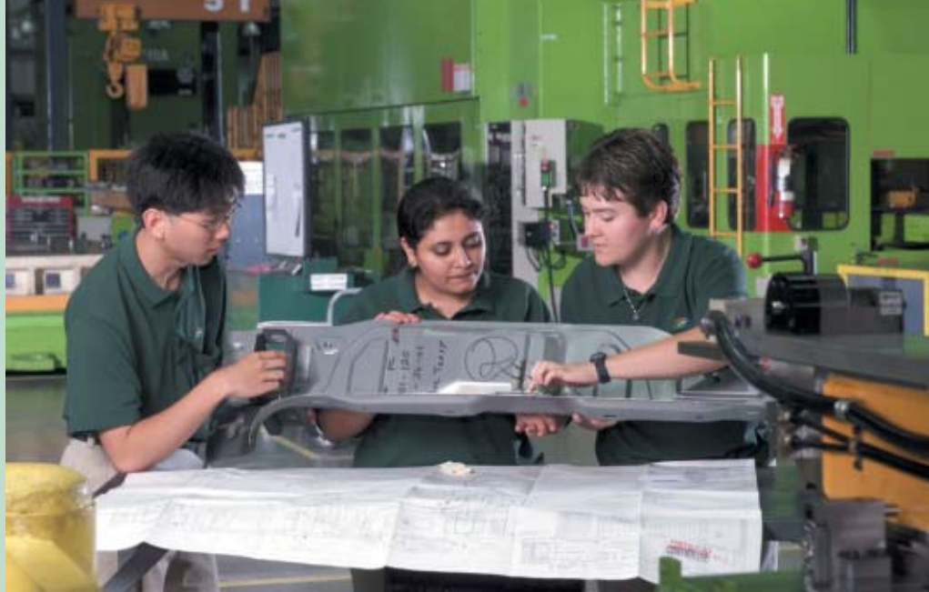
The Advisory Forum 2006 brought skills development for poverty reduction into focus.

recognition it deserves as a tool to reduce poverty. For a long time the focus of poverty reduction strategies had been on primary education but lessons from the past decades have clearly demonstrated that primary education is no guarantee for work.