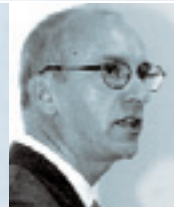
Raymond Van Ermen, rapporteur for the European civil society forum