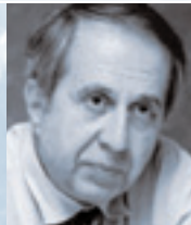
Emilio Gabaglio, General Secretary of the European Trade Union Confederation

The conference 'Citizens, players in European integration', held in Brussels on 7 and 8 October 2002 enabled participants to listen to many speakers representing civil society. Among these were Raymond Van Ermen, rapporteur for the European civil society forum, and Emilio Gabaglio, General Secretary of the European Trade Union Confederation (ETUC), who agreed to explain their perception of this event and the role of civil society in European construction.