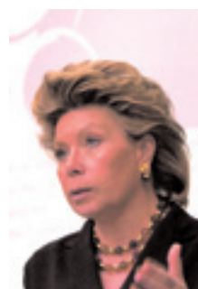
Viviane Reding, Member of the European Commission, responsible for Education and Culture.

Since 1989, the European Union has supported town twinning to strengthen existing links and encourage new ones. So far, more than 11 000 towns have benefited from EU grants. This year the EU is funding about 1 400 town twinning partnerships worth EUR 12 million in which two or more towns or cities from different countries share ideas, explore solutions to common problems, discover each other's cultural heritage and simply enjoy getting to know each other. These town partnerships offer people practical opportunities to participate in the European integration process, especially in the countries about to join the EU, allowing them to develop a sense of European identity. Special emphasis has been put on town twinning projects that involve smaller municipalities or young people.